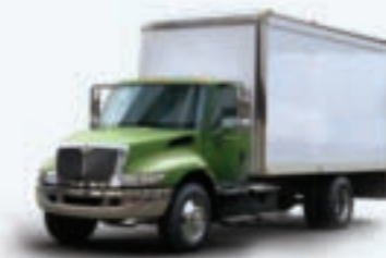
DURASTAR™ HYBRID DURASTAR™ HYBRID TRACTOR