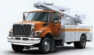
WORKSTAR® HYBRID 4X4